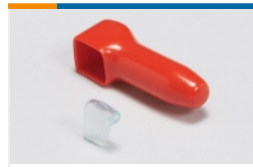
Insulation Boots &amp; Sleeves(4)